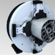
Flexible matching of various tube types