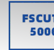
Digital bus control system