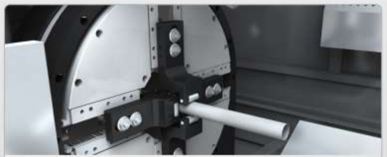
Double row of jaws Guarantee of accuracy