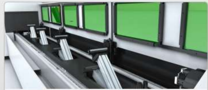
Full servo dynamic support Perfect fit all kinds of pipes