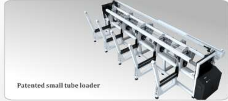
Patented small tube loader