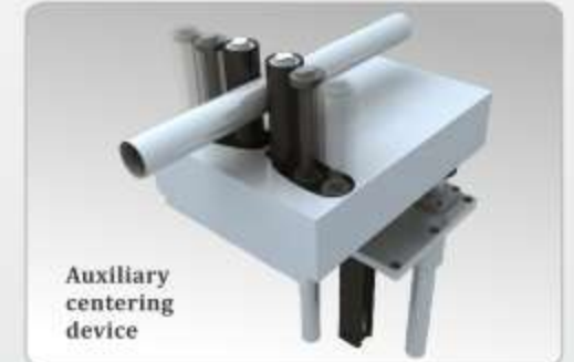
Auxiliary centering device